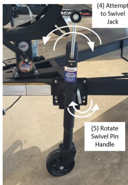
Figure 2. Steps taken to physically ensure the swivel pin is fully engaged.

Warning: Only perform these steps when the weight of the trailer is securely supported by the tow vehicle hitch. Keep body, feet, and bystanders clear of the trailer tongue while conducting the inspection.