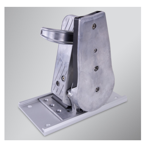
Made of Reliable A380 Aluminium