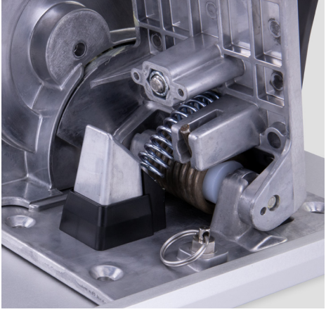
Stainless Steel Torsion Spring to Provide a Long Life