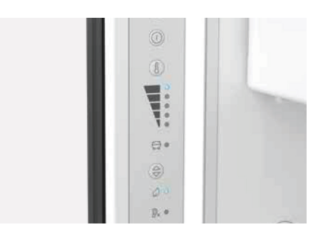
3. Touch control panel Flush-mounted inside the cabinet, with integrated LED light bar