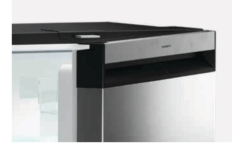
2. Full-width door handle Neatly integrated for easy access from every angle