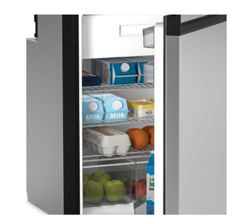
6. Well equipped interior Freezer, shelves, bottle holder, door tray, crispers – it's all there!