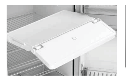
4. Removable freezer The freezer compartment can easily be removed to make room for more fridge storage