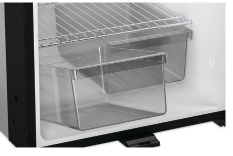
5. Two crispers For storing fruits and vegetables at the optimal temperature